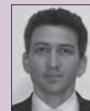
Mitch Reznick HERMES CREDIT

Outstanding Speakers from the Following Organisations: